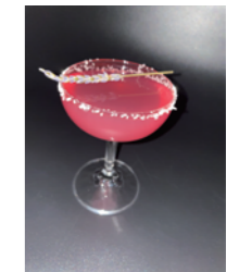
Lavender Jasmin 880 gin/ lavender/ jasmim/ lemon * NON-alcohol OK!