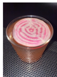
my bowl spiritz Bitter orange 880 mezcal/ bitter orange/ orange KOMBUCHA * NON-alcohol OK!