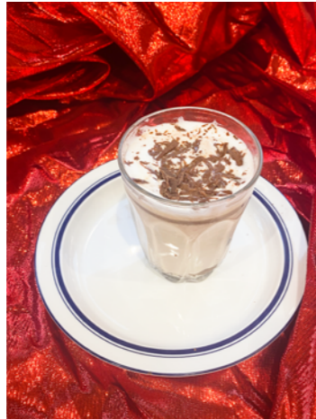
Black+White Double Hot Chocolate 680 Vegan Hot Chocolate 680