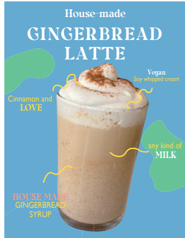
my bowl GINGERBREAD LATTE 650